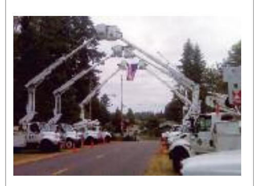
Local 77 service linemen with Puget Sound Energy align bucket trucks at memorial service for Bro. Bill Green.